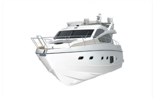
Manhattan 63 model