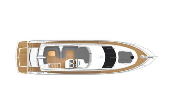
Manhattan 63 fly plan