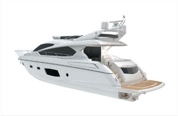
Manhattan 63 model