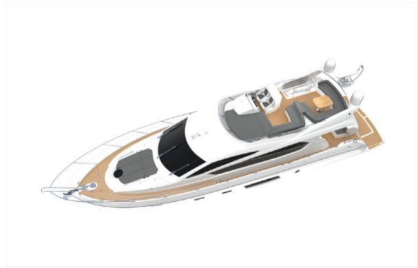
Manhattan 63 model